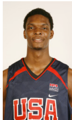
Bosh averaged 9.1 points and a team-high 6.1 rebounds per game.